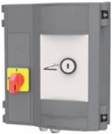
Classic Plus (standard)

The dock leveller is operated via the control system type Classic Plus included as standard. The components of the control system are RoHS-compliant (unleaded).