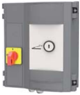
Classic Plus (standard)

The dock leveller is operated via the control system type Classic Plus included as standard. The components of the control system are RoHS-compliant (unleaded).