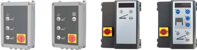
SuperVision 5 (standard)

The dock leveller is operated via the control system supplied along with it, viz. SuperVision 5. The components of the control system are RoHS-compliant (lead-free). The i-Vision control system is available as an option.